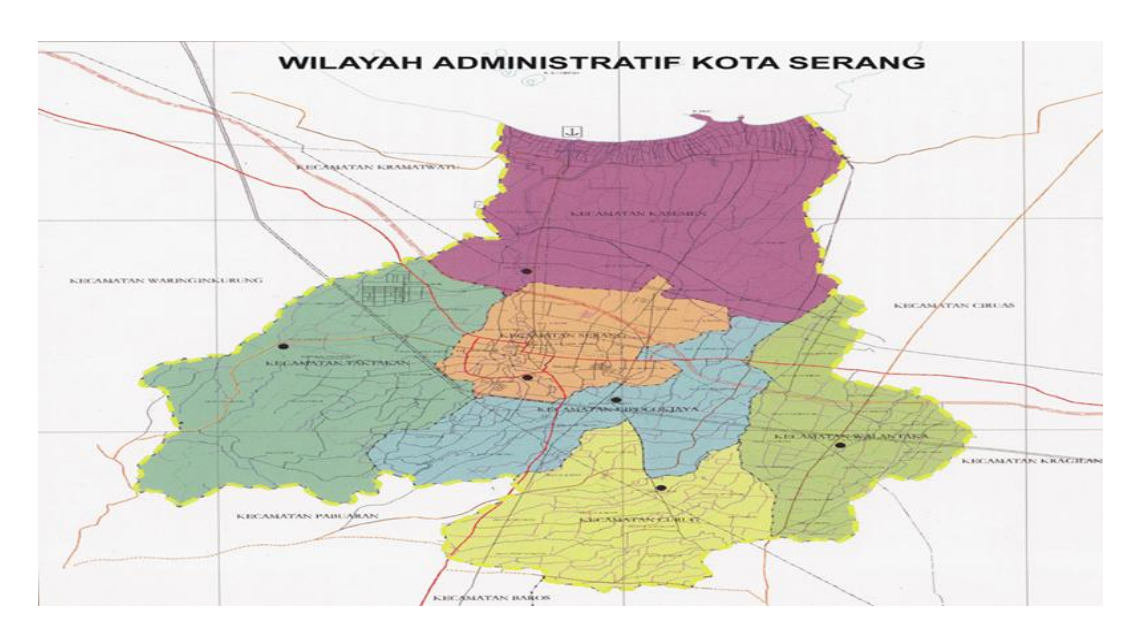
Suharsih, The Use of Banten-Dialect Javanese Language as the Identity Marker